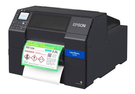
CW-C6500P 8" Peel-and-present