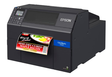
CW-C6500A 8" Auto Cutter