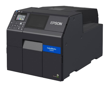
CW-C6000A 4" Auto Cutter

With a 4" or 8" built-in auto cutter covering the full spectrum of label sizes to create variable-length labels and enable easy job separation, these new ColorWorks models offer cost and inventory reductions compared to using pre-printed labels.