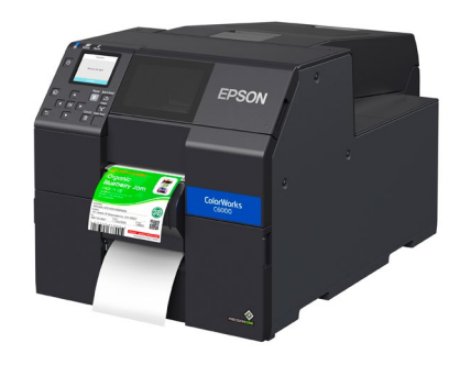
CW-C6000P 4" Peel-and-present

Epson offers the first color inkjet printer with peel-and-present capability, which can help speed up the manual application of on-demand labels. An integrated label-taking sensor holds off subsequent printing until the previous label is removed. This feature is ideally suited for fully automated label application systems. This unique capability eliminates the need for a loose loop and allows individual labels to be taken as soon as they are printed.