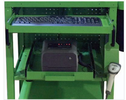
Optional slide-out keyboard tray, printer tray and scanner holder