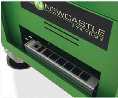
Easy-access power strip